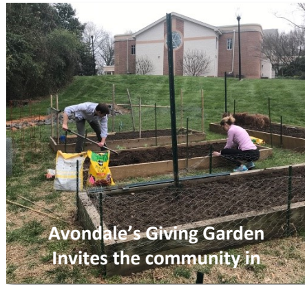
Avondale's Giving Garden Invites the community in

Avondale Children's Center's five-star rating indicates that the Center provides children with a wide range of enriching experiences that are vital for growth and development.