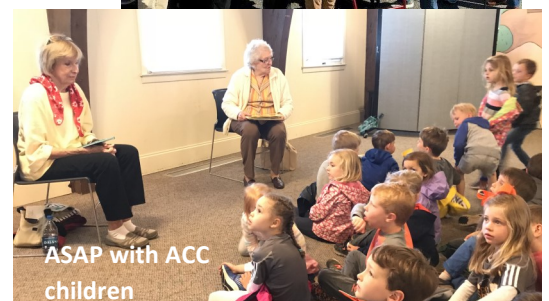
ASAP with ACC children