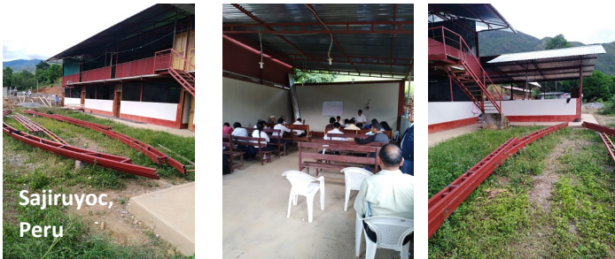
See "Update from Peru" on previous page.

The Children's Center has the capacity to serve up to 78 children, with a current enrollment of 76. These children are certainly in good hands each day, thanks to the level of education and training of the Children's Center's staff.