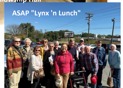
ASAP "Lynx 'n Lunch"