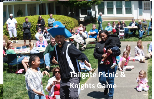
Tailgate Picnic & Knights Game