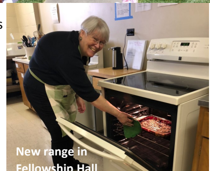
New range in Fellowship Hall