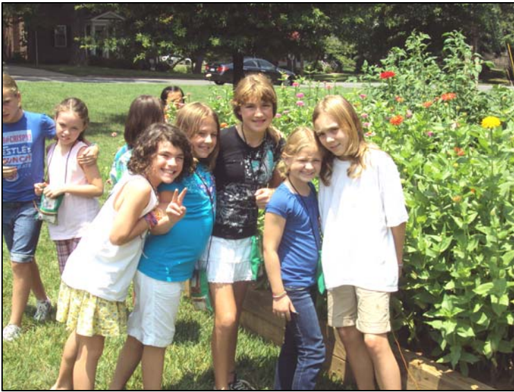
Having fun at Boabab Blast Bible Camp.