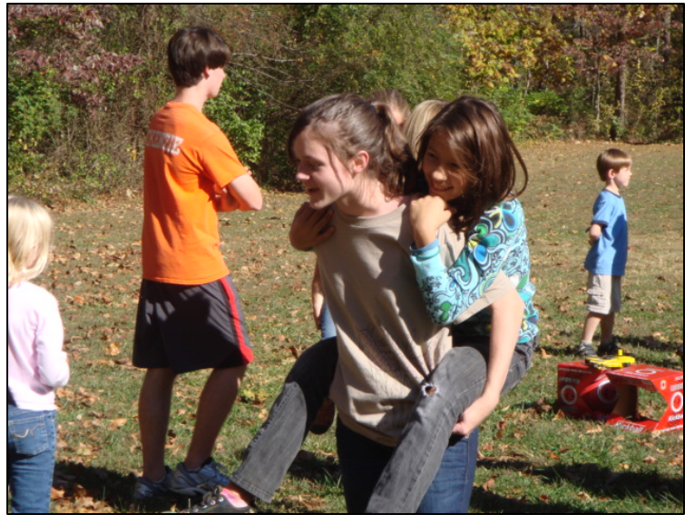
Enjoying the afternoon at the Congregational Retreat.