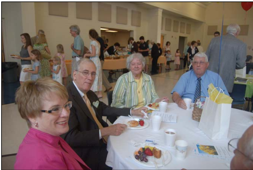
Sharing fellowship with others at a church luncheon.