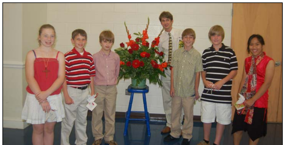
Middle school youth confirmed on Pentecost Sunday.