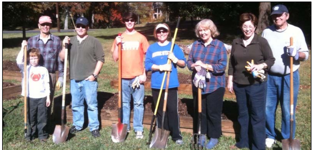
Preparing beds for Common Grounds Garden.