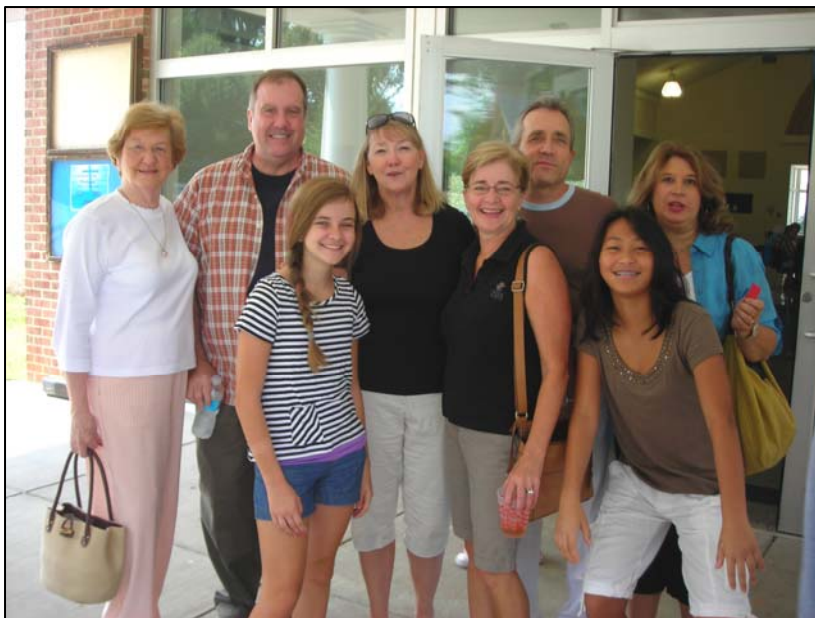
Gathering for BBQ with friends at our fall Celebration Weekend.